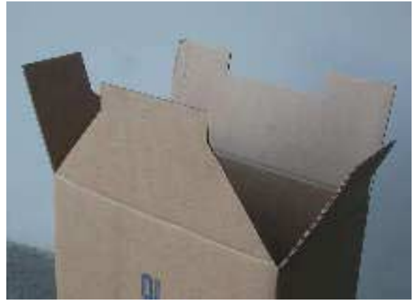
Step 5 On the other end, fold all creases to loosen them.