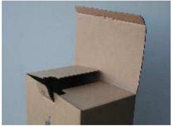
Step 2 Fold down the two side flaps shown.