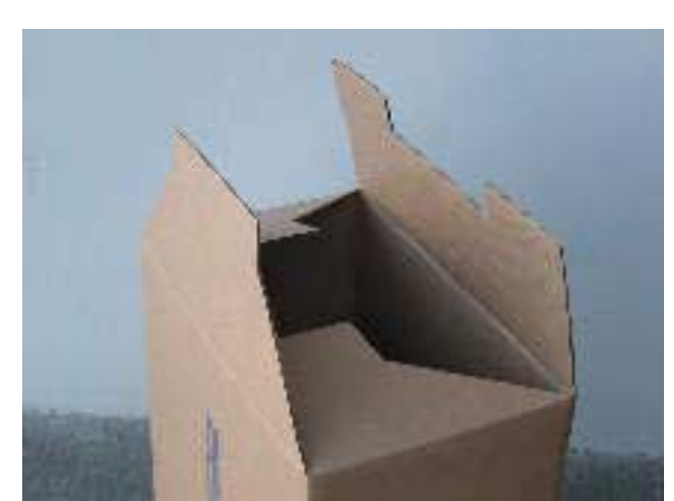
Step 6 Fold down the two side flaps shown.