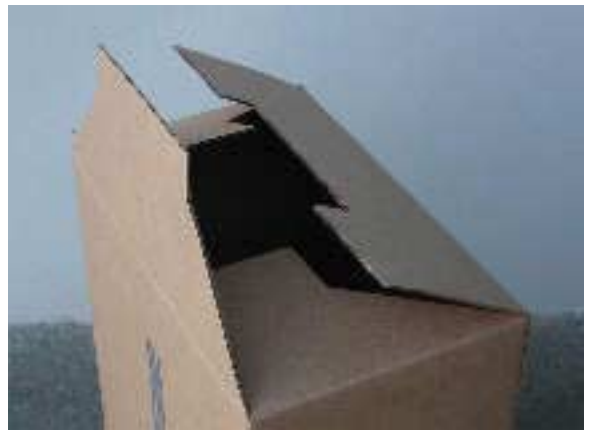
Step 7 Fold down the flap at right.