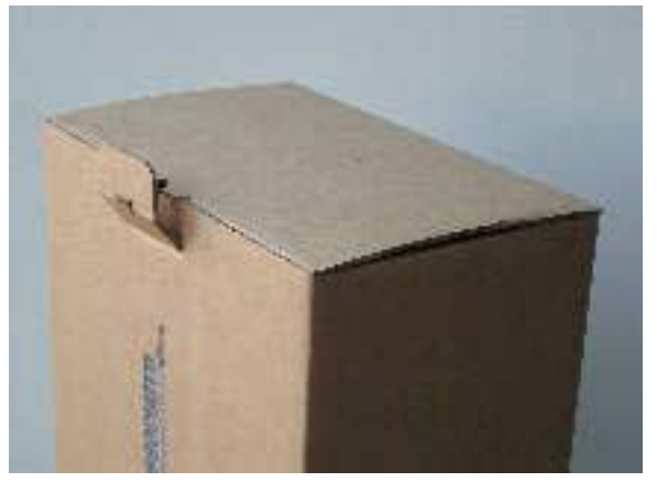
Step 3 Tuck the top down over the two flaps.