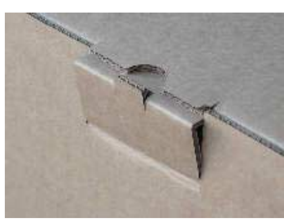
Step 4 Close the remaining clasp.