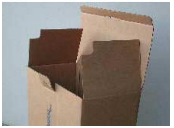
Step 1 Fold all creases to loosen them.