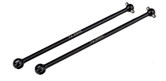
#71155 RC10T6.2 Rear CVA Bones, 92.5mm