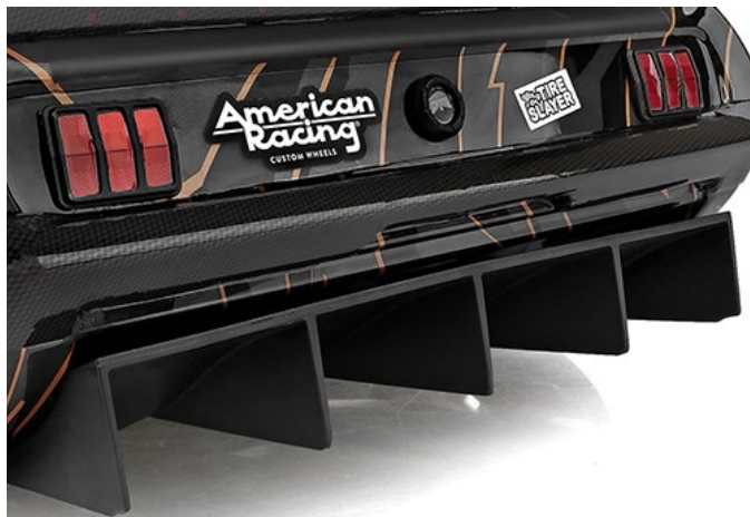
Molded spoiler, tail lights, and rear diffuser for the ultimate handling at high speeds.