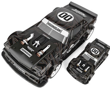
Size comparison: The 1:7 scale SR7 Hoonicorn compared to our 1:14 scale Reflex 14R Hoonicorn

Team Associated is excited to partner once again with Hoonigan to bring you their world-famous Hoonicorn in 1:7 scale radio control form. Designed from the ground up by our in-house Area 51 Design Works engineers, the Team Associated SR7 chassis is our largest and most powerful RC car ever! This makes it the perfect platform for the Hoonicorn and tire-slating action!