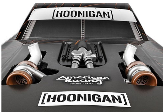
Molded turbochargers, intake manifold, and realistic window decals for ultimate scale detail.