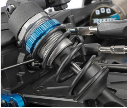
Threaded, aluminum oil-filled shocks with adjustable positions.