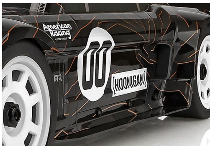
Molded side skirting with hook and loop for enhanced body mounting.