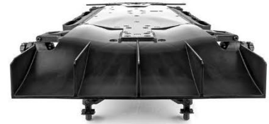
A rigid die-formed aluminum chassis with integrated splitter and diffuser for superior aerodynamics at high-speeds.