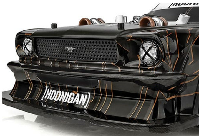
Molded '65 Ford Mustang grille and headlight buckets that hold optional LEDs (sold separately).