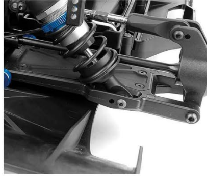
Monocoque suspension front and rear arm design for precise handling and durability.