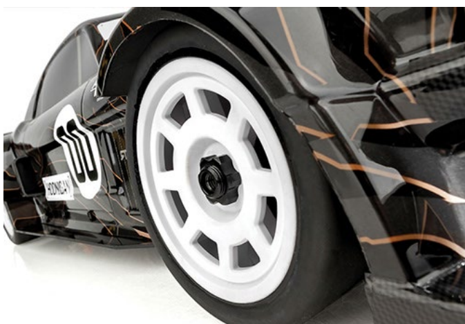
Licensed American Racing Wheels and belted slick high-traction tires.