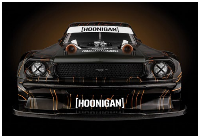
Officially licenced Ford / Hoonigan Mustang Hoonicorn Body Set.