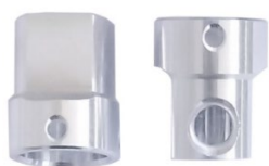
#92264 RC10B74.1 Factory Team CVA Cup, Center, aluminum