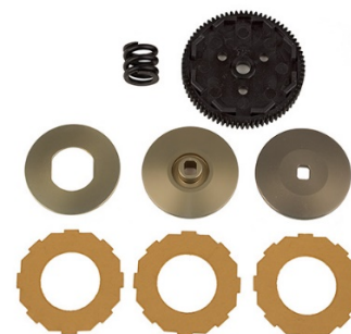
#92282 RC10B74.1 3-Pad Slipper Conversion

Three new option parts are available now for the RC10B74.1 and RC10B74.1D buggy. Replace steel CVA cups with light-weight aluminum or tune the slipper clutch power delivery with the 3-Pad Conversion.