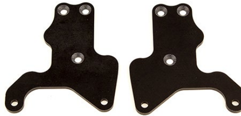
#81441 RC8B3.2 FT Suspension Arm Insert, G10, Front Lower, 2.0 mm