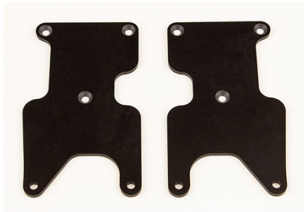
#81437 RC8B3.2 FT Suspension Arm Insert, G10, Rear, 2.0 mm