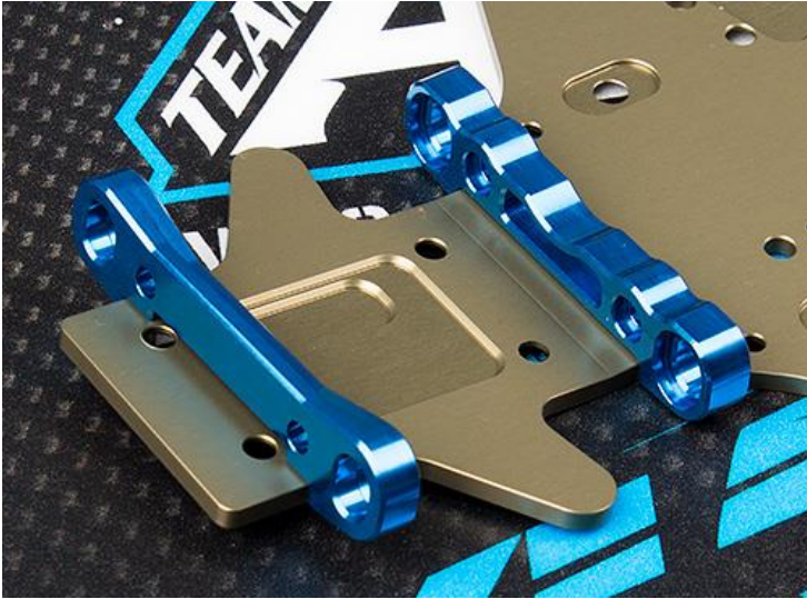
Arm Mounts A (left) and B