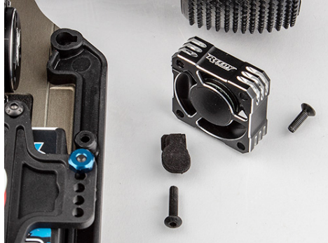
Angled Fan Mount unmounted