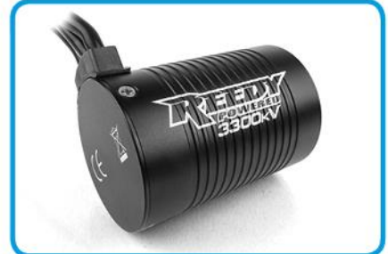
Reedy 3300kV brushless motor