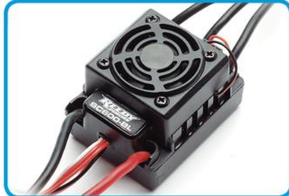
Water-resistant Reedy brushless electronic speed controller with High Current T-Plug