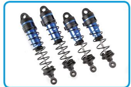
Fluid-filled, blue anodized aluminum V2 Big Bore shock bodies, front and rear