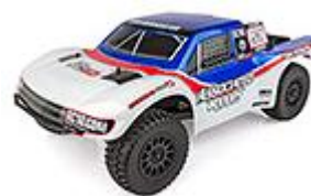
Alternate body scheme: #70016 ProSC10 AE Team