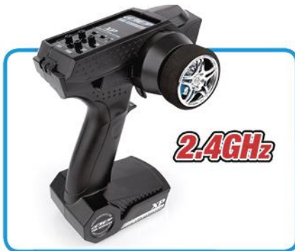
XP 2.4GHz radio system