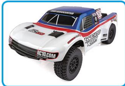
Alternate body scheme: #70016 ProSC10 AE Team