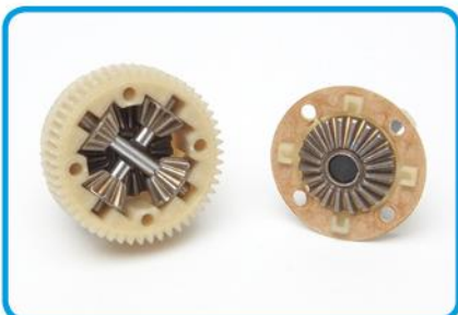
2.6:1 ratio gearbox with heavy-duty sealed gear differential