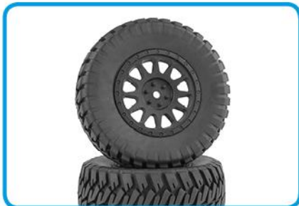
High-traction racing compound tires mounted on hex drive wheels