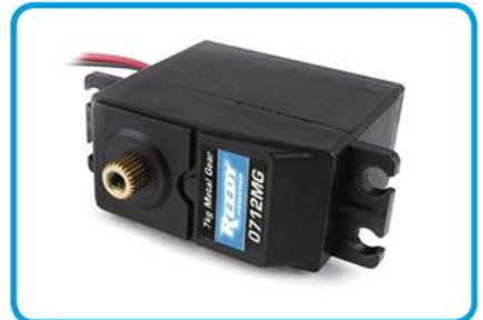
Metal-gear, digital, high-torque Reedy servo