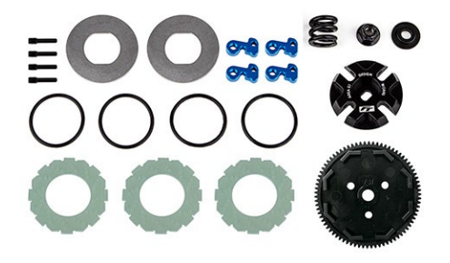
#72026 FT Lockout Slipper Clutch (instructions included)