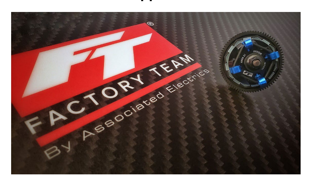
(Pictured: #72026 FT Lockout Slipper Clutch.)

Get the most out of your No Prep Drag Cars with our NEW Factory Team Lockout Slipper Clutch!