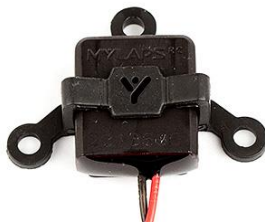
MyLaps Hybrid Black Edition (2-wire) Transponder

The Hybrid (2-wire) transponder is the same size and features many of the same specs as the RC4 transponder, but it is backwards compatible with older decoder boxes. This transponder does not support car ID numbers. It is compatible with all AMBrc2 decoder boxes and MyLaps RC3 and RC4 decoder boxes.