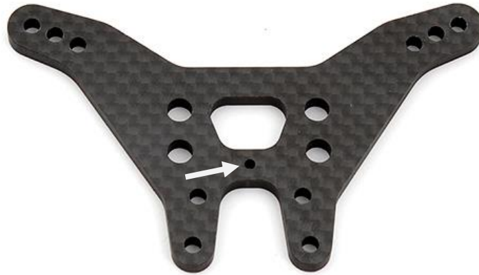
#91666 B6 Rear Shock Tower (Long)

Arrow shows hole added to distinguish this optional tower from the standard tower