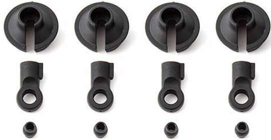
#81194 Shock Rod Ends & Spring Cups, 20mm