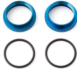
#81221 Spring Collars, 20mm

20mm shock rod ends, spring cups, and collars allow a wider variety of 20mm sized springs that can be used, providing drivers with more options for fine tuning their vehicle. For RC8B3, RC8B3e, RC8T3, RC8T3e.