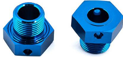
#81080 RC8B3 wheel hexes, +2mm wide

Optional width wheel hexes alter the vehicle's handling by changing steering feel and vehicle roll stiffness. Wheel hex width is a great way to add or reduce effective steering and also gain or reduce roll stiffness. For RC8B3, RC8B3e.