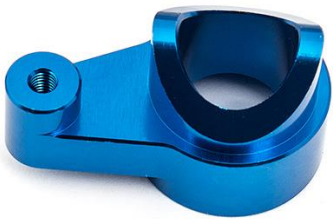
#81085 Servo Saver Arm, aluminum

Aluminum servo saver arm adds significant strength with little weight. For RC8B3, RC8B3e, RC8T3, RC8T3e.