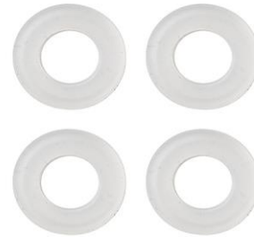
#81184 Bleeder Shock Cap Seals, 16mm

When used in combination, the bleeder shock caps and bleeder shock cap seals give drivers the ability to run emulsion-style shocks. Perfect for tracks with large jumps and flat landings, in addition to tracks with looser surfaces. For RC8B3, RC8B3e, RC8T3, RC8T3e.