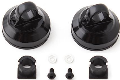
#81179 Bleeder Shock Caps, 16mm