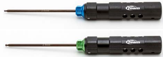
#1502 (top), #1504