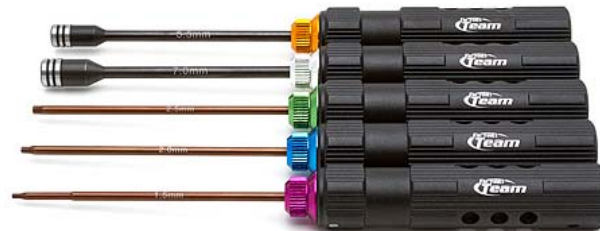
#1519 FT Hex/Nut Driver Tool Set