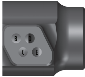
Aluminum Rear Hub