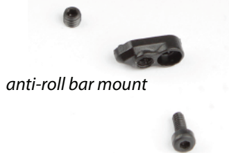
anti-roll bar mount

The set screws need to be tightened just enough to hold the bar in place, but still allow for free movement of the bar.