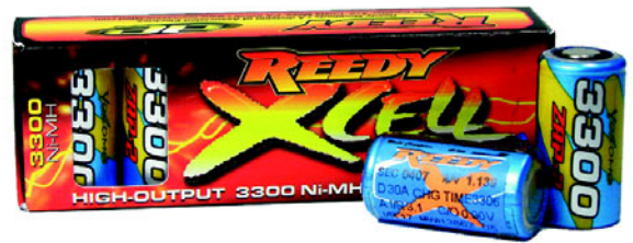
Fig. 1 Battery cells.

Your batteries (fig. 1) power your electrical components. They determine your run time and maximum power transmitted to the motor.