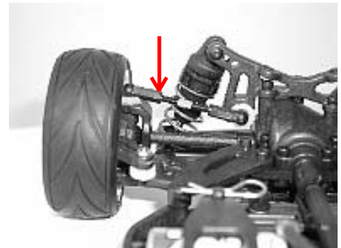
Fig. 2 Turn the camber link to change camber.