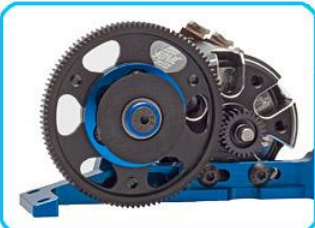
New one-piece motor mount