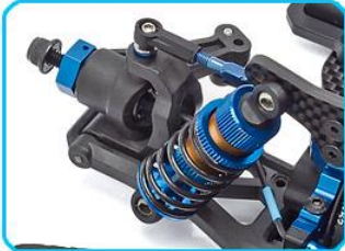
Updated suspension geometry