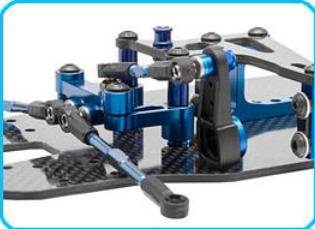
Updated dual bellcrank steering system and floating servo mount