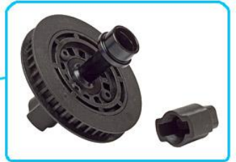
Front spool with replaceable composite outrdrives