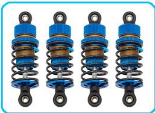
FOX® shocks with Genuine Kashima® Coat