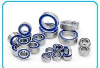
22 precision ball bearings

RC10TC7 FT Kit shown equipped with items NOT included in kit: Reedy motor, Reedy battery, Reedy ESC, servo, receiver, and pinion gear. Body, wheels, and tires are not included. Assembly and painting required.