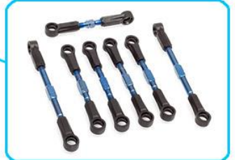
Titanium turnbuckles with turnbuckle eyelets for easy access to ball stud for adjustment