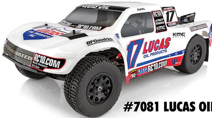
#7081 LUCAS OIL