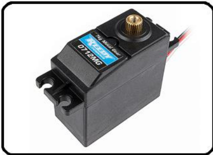
Metal-gear, high-torque Reedy digital servo