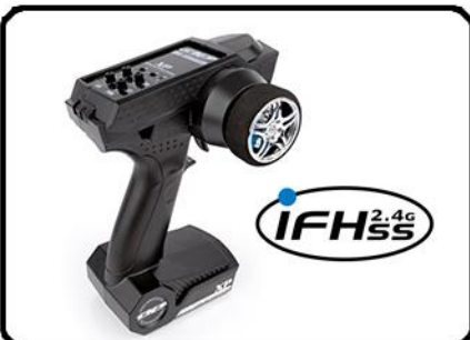
XP 2.4GHz radio system