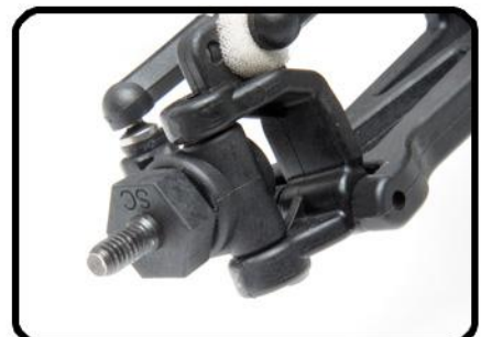
Hex-drive wheels front and rear