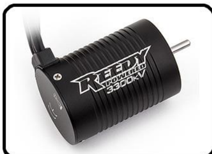
Reedy 3300KV brushless motor