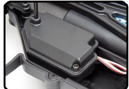
Water-Resistant enclosed receiver box