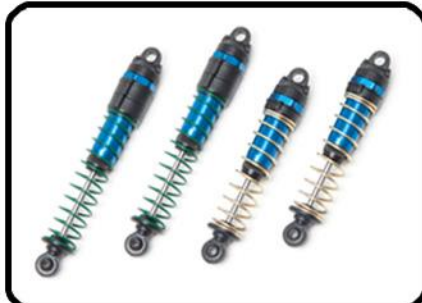
Blue anodized aluminum V2 coil-over shocks