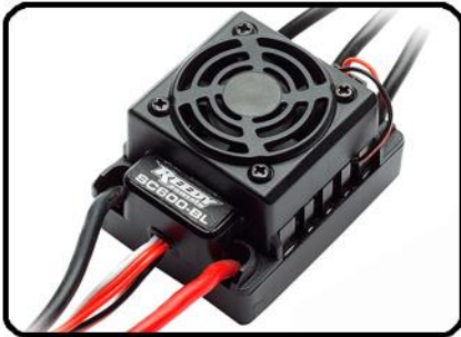
Water-Resistant Reedy brushless ESC