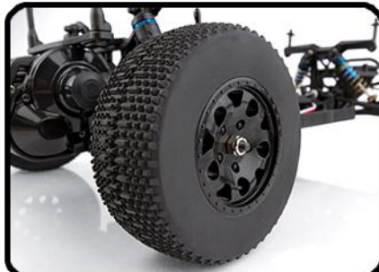
High-traction racing compound rear tires