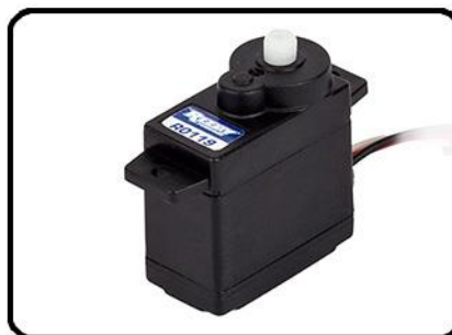
Reedy Powered servo