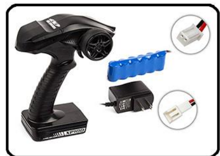
Transmitter, battery and wall charger