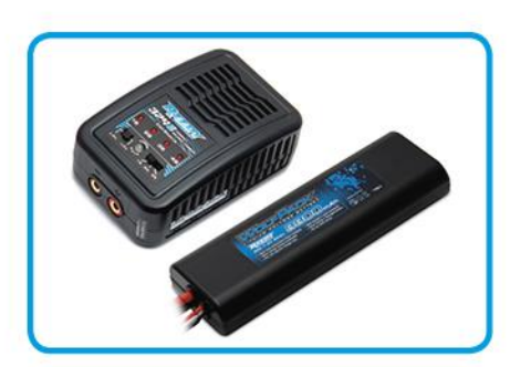
Combo #90040C includes a Reedy Compact Balance Charger and Reedy 7.4V LiPo Battery with T-plug