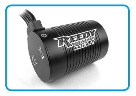
Reedy 3300kV brushless motor