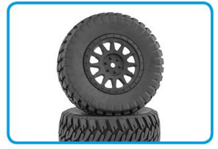
High-traction racing compound tires mounted on hex drive wheels