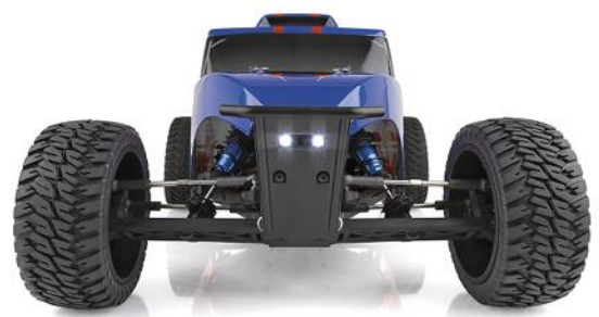
Factory-finished body with integrated LED lights, 2 front, 2 rear