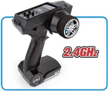
XP 2.4GHz radio system