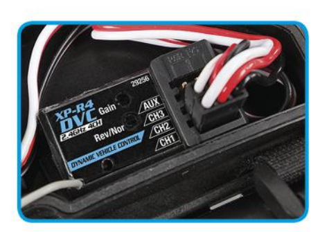
New DVC (Dynamic Vehicle Control) receiver featuring built-in adjustable gyro