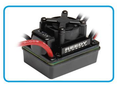
Water-resistant Reedy brushless electronic speed controller with High Current T-Plug