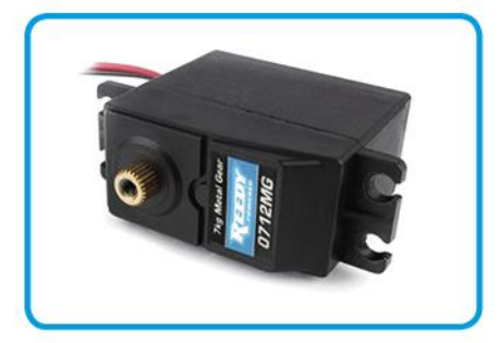
Metal-gear, digital, high-torque Reedy servo