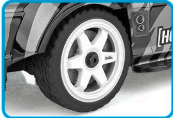
Lightweight, race-inspired wheels