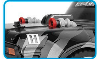
Injection-molded hood, turbo and exhaust accessories