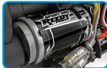
Reedy brushed speed control and 3-pole brushed motor