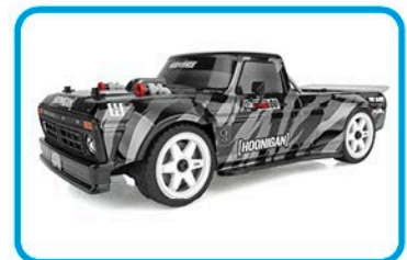
Reflex 14R with licensed Hoonigan® Hoonitruck

Due to ongoing R&D, photos may not match final kit. Vehicle shown on these pages equipped with items NOT included in #20177: Reedy battery.