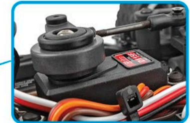
High-Torque Digital Servo with spring-style servo saver