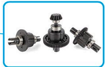
Three sealed differentials