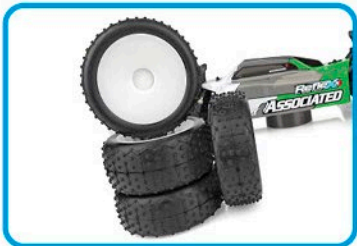
Off road 12mm hex drive white wheels with high-grip racing tires