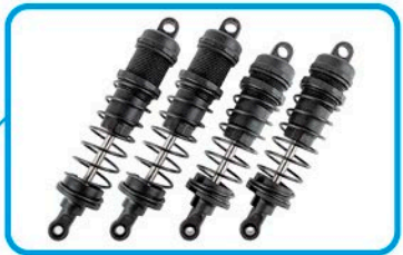
Threaded coil-over shock absorbers