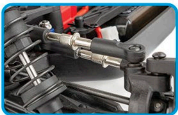
Adjustable turnbuckles and aluminum steering rack