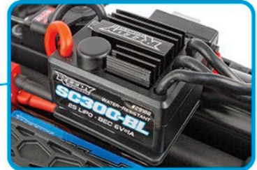
Water-resistant high-power Reedy brushless ESC with T-plug connector