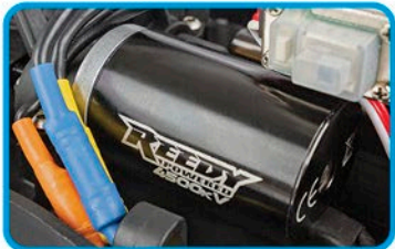
Powerful Reedy 4500kV brushless motor