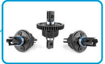
46T ring and 10T pinion gears on front and rear V3 differentials for consistent performance