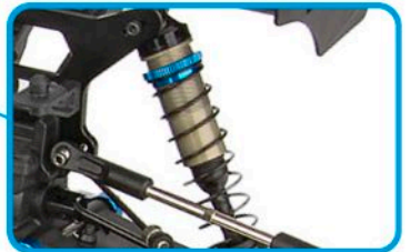
New stiff shock bladder design improves jumping and handling performance