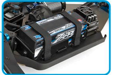
Side guards are now threaded into the chassis from the top side of the car