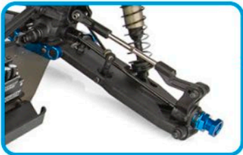
Longer rear suspension arm length with narrow rear arm mounts