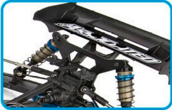
I.F.M.A.R.-approved rear wing