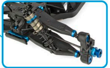
New suspension arm design with inserts for flex adjustments