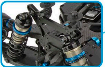
Updated shock cap works for bladder or emulsion style shock setups