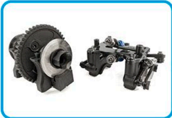
New center bulkhead splits into unique front and rear top halves to prevent brake misalignment