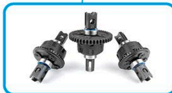
46T ring and 10T pinion gears on front and rear V3 differentials for consistent performance