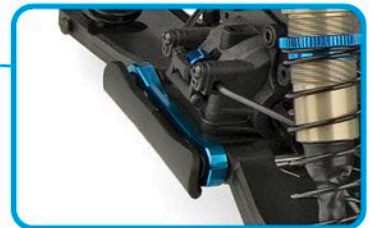
Shorter and lower front bumper reduces drag and allows easier access to anti-roll bar screws

Due to ongoing R&D, photos may not match final kit. Vehicle shown on these pages equipped with items NOT included in kit: engine, pipe and header, transponder, servos, receiver, wheels, tires. Assembly and painting required.