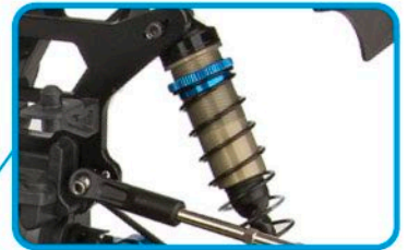
New stiff shock bladder design improves jumping and handling performance