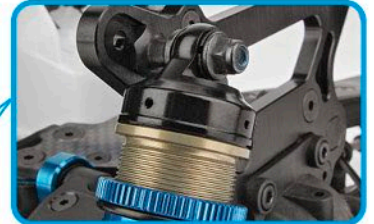
Updated shock cap works for bladder or emulsion type shock setups