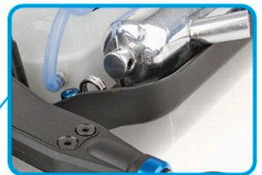
Side guards are now threaded into the chassis from the top side of the car