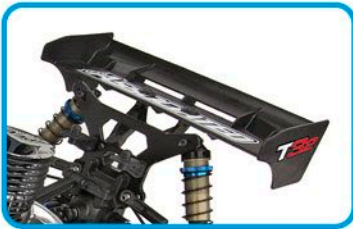
I.F.M.A.R.-approved rear wing