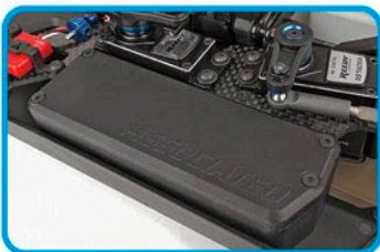
Enclosed battery box for quick and easy battery removal. Larger receiver box for better wire management