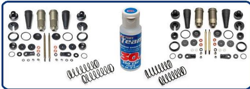
Includes Shock Kit Upgrade. Front Shock Kit. Front Spring Set. Shock Fluid. Rear Shock Kit. Rear Spring Set. A $156.45 value!