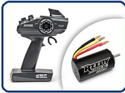
XP 2.4GHz radio system and Reedy 2000kV brushless motor