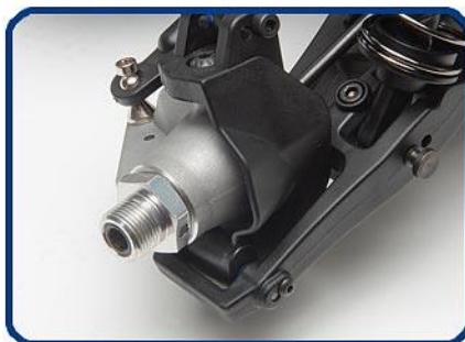
Aluminum steering knuckles for improved durability