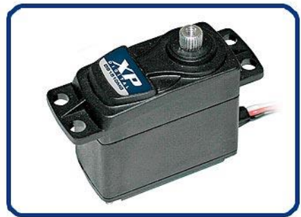
High-torque XP metal gear servo