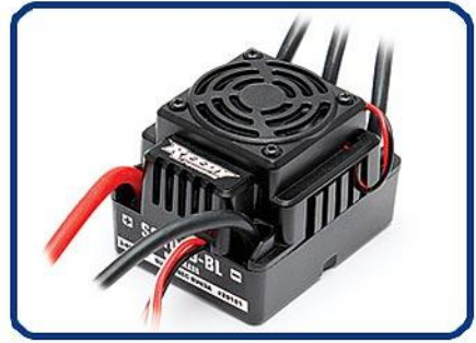
Reedy brushless ESC