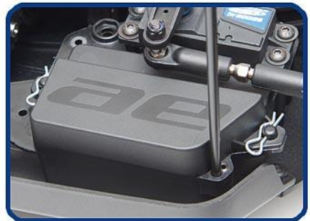
Enclosed receiver box