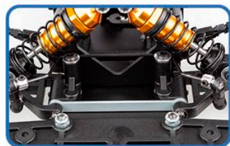
Adjustable front and rear anti-roll bars