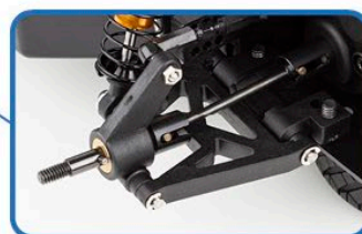
Adjustable rear toe-in