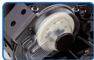
Stealth transmission with A.T.C. slipper