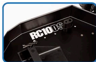
Black anodized aluminum tub chassis (chassis etching only found in kits)