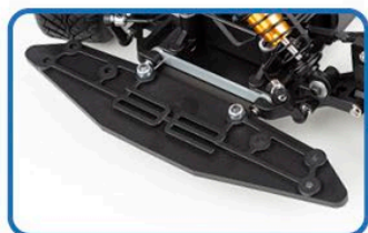
High-impact front bumper