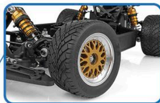
Scale mesh style chrome wheels