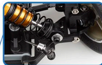
Molded ultra-stiff composite suspension arm, front and rear