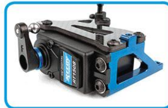
Aluminum/carbon fiber floating servo mount offers a tweak-free assembly