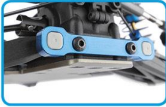
Differential case shims included