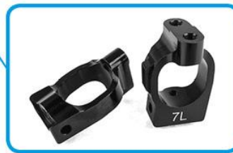
Precision-made 7-degree aluminum caster blocks for added durability