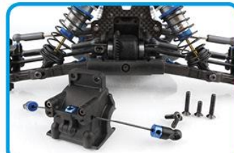
Easy access to diff internals. Anti-roll bars included.