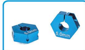
5mm front wheel hexes