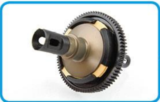
New adjustable center slipper with Low Coefficient Friction (LCF) pads