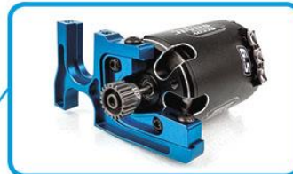
Aluminum floating motor mount allows consistent torsional chassis flex