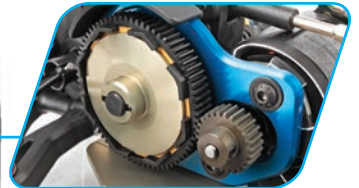
Octalock spur gear and 19mm LCF pads