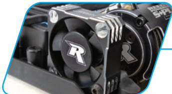
Integrated 30mm fan mount (fan not included)