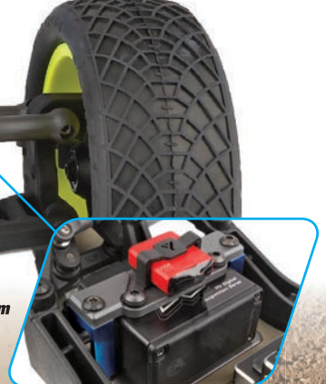
NEW direct-to-chassis aluminum servo mounting system