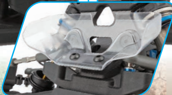
Front wing mount and wing included