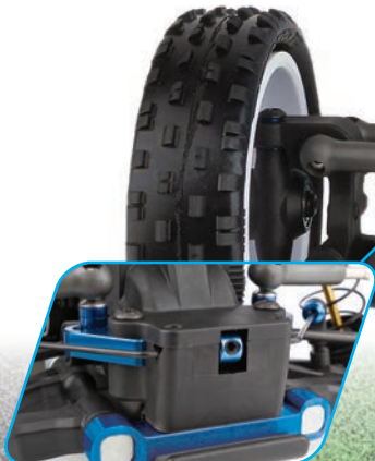
Front and rear anti-roll bars for less body-roll and more traction on high grip surfaces