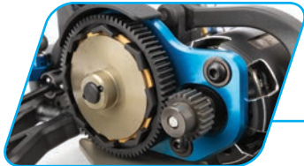
Octalock spur gear and 11mm LCF pads utilizing the heavier B74.1 spring