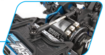
Rod end battery brace parts and hardware included in kit