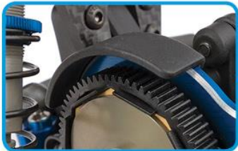
Molded spur gear guard to help protect body from damage