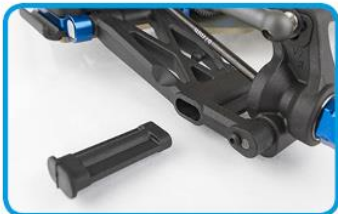
Innovative rear arm with molded inserts for ultra-fine lower shock mount adjustment