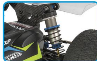
V2 springs for more reactive and nimble feel