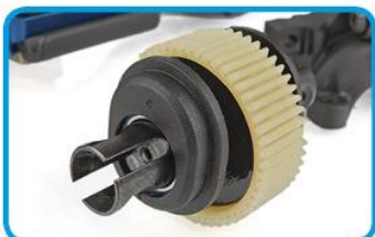
Differential height adjustment with 0, 1, 2, and 3mm inserts included