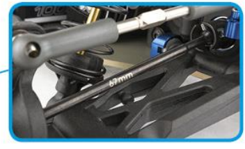
Heavy-duty V2 rear axle with 67mm bones