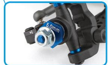
+1 steering block arms optimize feel on dirt tracks