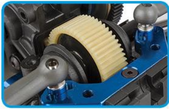
Easy-access ball differential