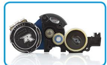
3-gear Lay Back Stealth® transmission for lower and rearward CG