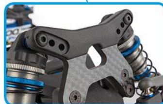
Heavy-duty V2 routed graphite front shock tower & tower guard