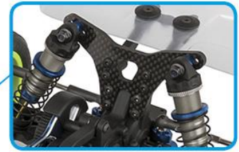
Heavy-duty V2 routed graphite rear shock tower, long