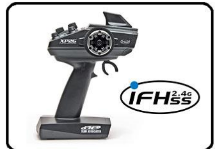
XP2G 2.4GHz radio system