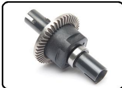
Heavy-duty front and rear gear differentials