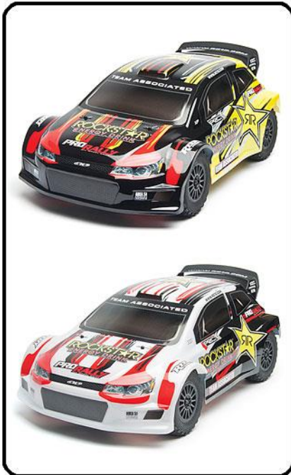
Your choice of two factory-finished Rockstar bodies