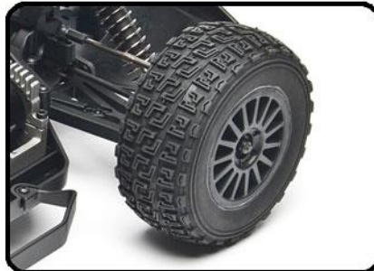
Realistic rally-inspired hex drive wheels with high-grip, all-terrain tires