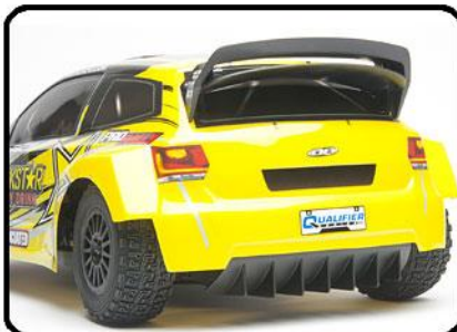
Durable front bumper and rear diffuser