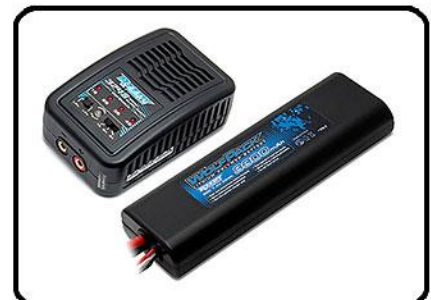
For #7071C only: Reedy LiPo battery and Reedy compact balance charger