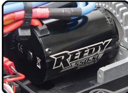
Reedy 550-SL 3500KV brushless motor