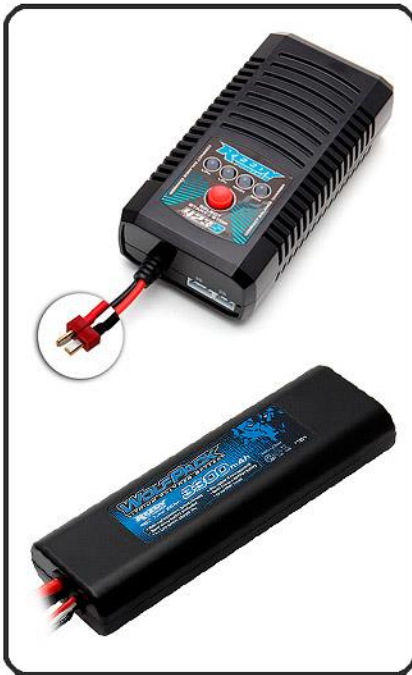
#616 423-S Charger and #751 Battery are included in the #7063C LiPo Combo