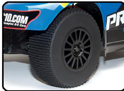
15-spoke offroad hex drive wheels with high-grip racing tires