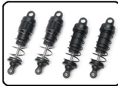
Huge 16mm Big Bore shocks