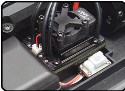
Reedy SC800-BL brushless speed control with High Current T-plug Connector