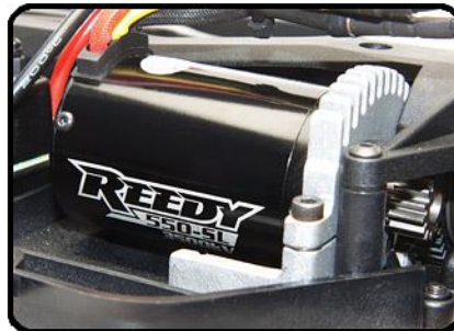
Reedy 550-SL 3500kV 4-pole brushless motor