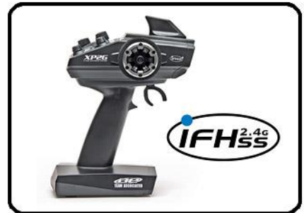
XP 2.4 GHz radio system