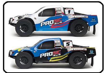
Two body color schemes to chose from