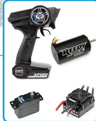
Powerful Reedy and XP electronics throughout: Reedy brushless motor, Reedy brushless speed control with high-current T-Plug connectors, XP 2.4GHz 2-channel radio system, XP high-torque servo, XP receiver