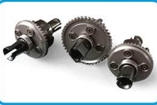
Strong and efficient metal-gear 4WD drivetrain