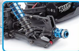
The durable suspension has been tuned and proven with the RC8 line of vehicles

Prototype shown. Due to ongoing R&D, photos may not match final kit. Nomad DB8 RTR shown on these pages equipped with items NOT included in kit: Reedy LiPo battery pack with T-plug connector.