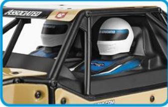
Detailed driver and co-pilot