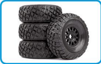
General Tires® Grabber™ tires put the power to the ground