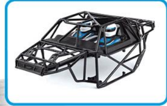
Bodies are mounted to a roll cage