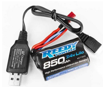
Charger and battery