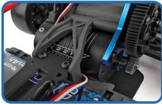
3300kV brushless motor included.

1:10 SCALE 2WD ELECTRIC READY-TO-RUN DRIFT CAR