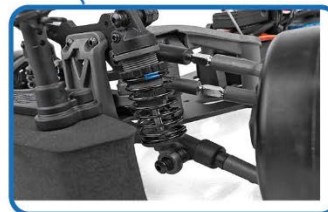
2.5mm G10 shock towers

Due to ongoing R&D, photos may not match the final kit. Vehicle shown on these pages equipped with items NOT included in RTR: Reedy motor, battery, ESC, servo, receiver, wheels, tires, body, and pinion gear. Assembly and painting required.