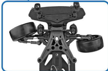
Maximum steering throw for optimal control drifting through turns