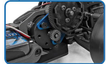
Fully upgradable with many options and tuning capabilities