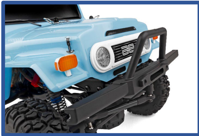
Off Road Style Front Bumper