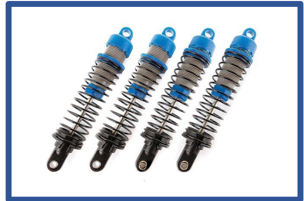
Fully Adjustable, Threaded, Fluid-filled Shocks