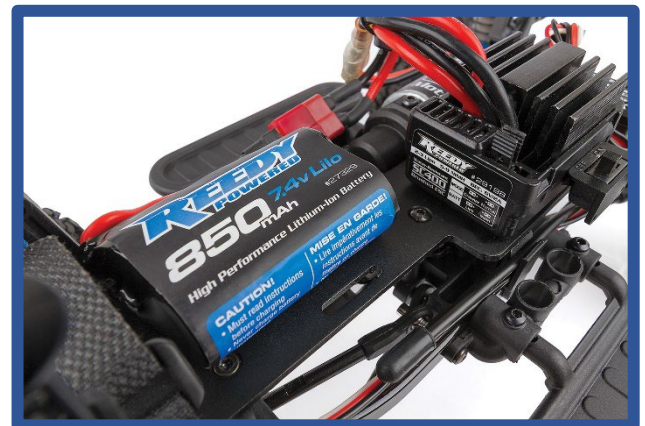
Reedy Power water-resistant speed control, 380 motor, servo and 850mah Li-ion battery