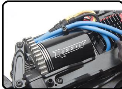
Reedy 3300KV brushless motor