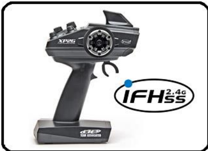
XP 2.4 GHz radio system