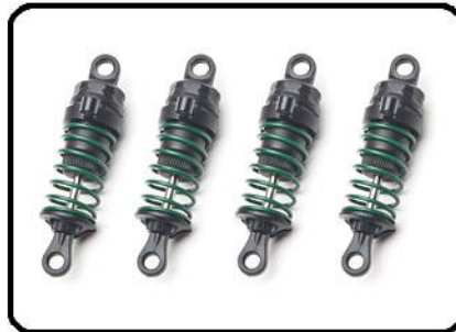
Adjustable fluid-filled shock absorbers