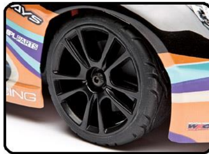
#30113: & 30113C: 10-spoke wheels with high-grip racing tires. #30113D & 30113DC: with hard plastic drift style tires.