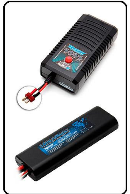
#616 423-S Charger and #751 LiPo Battery are included