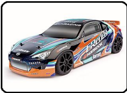
Scion Racing FR-S Rocket Bunny replica body