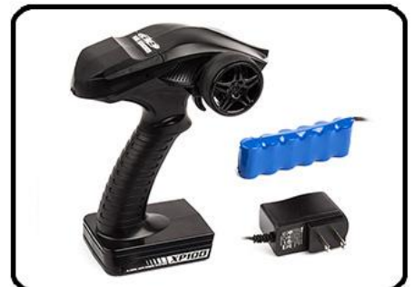
Transmitter, battery and wall charger