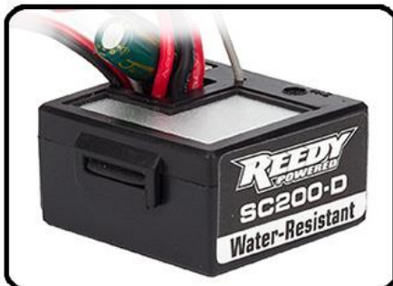
Reedy Powered all-in-one water-resistant speed control + receiver