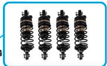
Threaded aluminum oil-filled shocks smooth out the bumps when ripping down the tarmac and shredding tires.