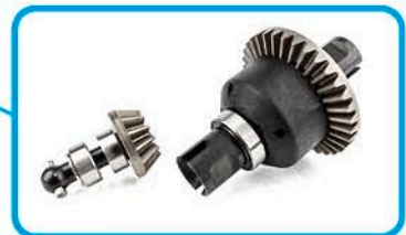
The Apex2 chassis is equipped with metal ring and pinion gears for long-lasting durability that can handle tire-slaying burn-outs.