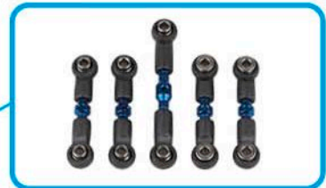
Factory Team adjustable blue turnbuckles.