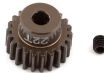
1340 (more top speed)