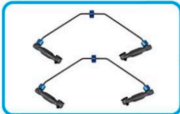
Front and rear adjustable sway bars.