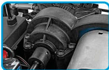
A sealed center driveline keeps dirt and debris out along with bits of tire rubber for smooth and reliable power delivery.