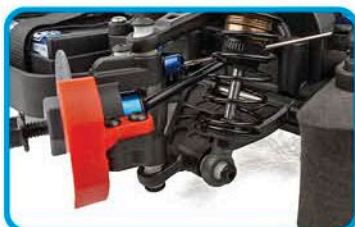
A-arm front and rear independent suspension keeps the Hoonigan kit under control during the wildest of driving conditions.