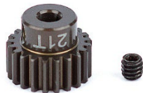
1339 (more top speed)